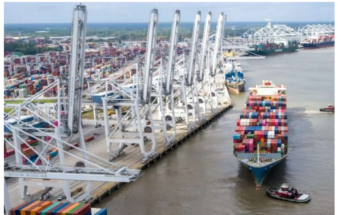
A vessel departs the Garden City Terminal, in Savannah.

In addition, the Georgia Ports Authority voted Monday to buy nine cranes to help move cargo. The cost was reported at $24.4 million.