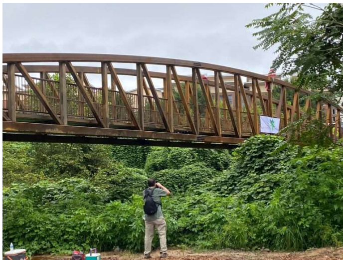
The South Fork Confluence Pedestrian Bridge overlooks the junction of the South and North Forks of Peachtree Creek.