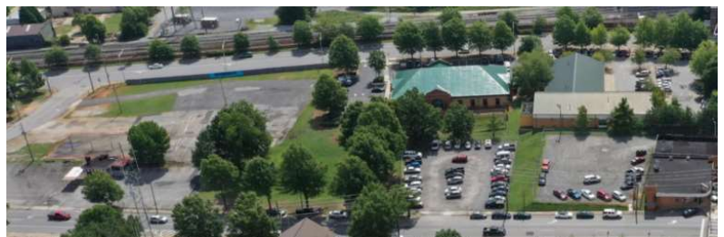
Site of new Downtown Commons development project in East Point, GA.

On Tuesday, East Point Mayor Deana Holiday Ingraham announced the $111 million