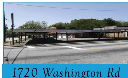
1720 Washington Rd

Approx. 30+ acre site, by MARTA Train Station. Loft offices, residences, space for creatives, retail, food establishments, community/event space and more! EastPointExchange.com . Call 404-350-1485.