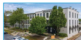
1513 East Cleveland Ave.

Jefferson Station 800SF –20,000 SF suites available. Located right by the PATH and easy walk to the East Point MARTA Train Station. Call 404-350-1485. Visit kairosopportunity.com for more information.