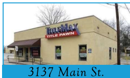
3137 Main St.

Located on high traffic Hwy 29/Main Street, currently used as a dry cleaners. Approx. 3632 SF on .33 acres. Asking $425,000. Call 404-618-0726 x1.