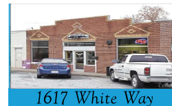
1617 White Way

Mixed-Use Project. Public-Private Partnership Development. Approx. 8+ ac. by MARTA Train on busy Hwy 29/Main St. Will have housing component. Great location for a grocer, retailers, services & restaurants. Call 404-270-7026.