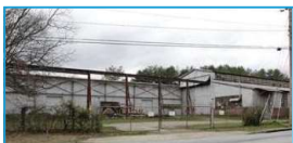
2903 RN Martin St.

Approx. 4896 SF High traffic corner lot on Hwy 29/Main St. at inter-section of Willingham and Main St. Nine (9) Surface Parking Spaces Available. Right next to Arden's Garden & close to Woodward. Call 404-509-5625.