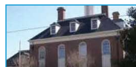
2818 East Point Street

Wagon Works 500SF –15,000+/- SF suites available. Located right by the Pedestrian Bridge, allowing an easy walk to the East Point MARTA Train Station. Lots of historic character. Call 404-234-3023.