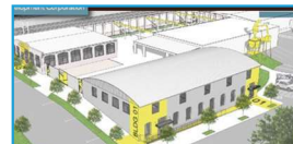
1562 East Forrest Ave.-

Locted on high traffic Washington Rd., walking distance to the East Point MARTA Train Station. Approx. 1,850 SF. Call 404-604-3333.