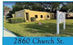
2860 Church St.

Multi-Media Production & Event Facility. Featuring cloud kitchens, a food truck court, business & production suites, event facility & more! Close to Tyler Perry Studios, 10 minutes from Downtown Atlanta & Airport. info@epicenter-ep.com .