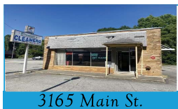
3165 Main St.

Loads of historic character, currently used as a retail storefront. Approx. 7406 SF. Walk to the East Point MARTA Station. Asking $1,250,000. Call 770-241-5658.