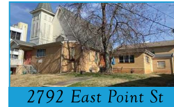
2792 East Point St

Great location, walking distance to EP MARTA Train Station. Approx. 1,687 SF. Currently used as law office, renovated in 2020. Six offices. $450,000. Call 404-767-3711.