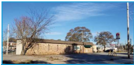
2975 Main St.