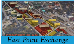
East Point Exchange