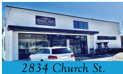
2834 Church St.

Mixed-use Office/Retail/Restaurant/Residential. Approx. 1.97 acres of potential mixed-use. Walk to EP MARTA Train Station, located on high traffic Washington Rd. Asking $2,000,000. Call 404-848-0996 for more information.