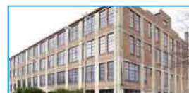
1526 East Forrest Ave.

Annex @Jefferson Station. Approx. 16,200 SF (50,000 RBA) on 1.76 acres. Multiple Buildings, loads of historic character, including exposed wooden beams. Walk to MARTA Station. Asking $2,400,000. Call 678-590-0133.