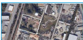
3056 Main St.

Artist Studios. Close to Ft. Mac MARTA Train station & located just off high traffic Hwy 29/Main St. Artist Studios from 500 SF+ Available. Call 404-632-4211.