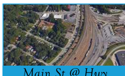
Main St @ Hwy

Approx. 1265 SF on .16 ac. w/parking. Great corner lot on high traffic Hwy 29/ Main St. Asking $500k. Call 404-252-1200.