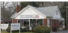
2731 Church St.

Future brewery & event center locating here, with additional space to lease alongside operations. Near EP MARTA Train Station, Approx. 7500SF available with on-site parking. Call 770-823-9568 for more info.