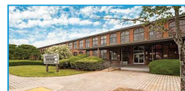
1514 East Cleveland Ave.

Buggy Works Bldg 100: 900SF – 16,000 SF suites available. Located right by the Pedestrian Bridge, allowing an easy walk to the East Point MARTA Train Station. Call 404-350-1485. Visit kairosopportunity.com for more information.